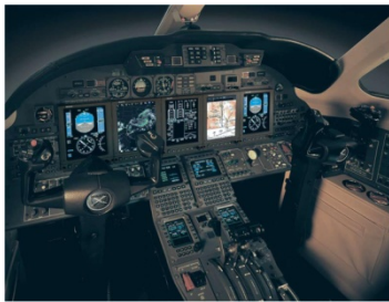
Citation X Flight Deck With Primus Elite™ 875